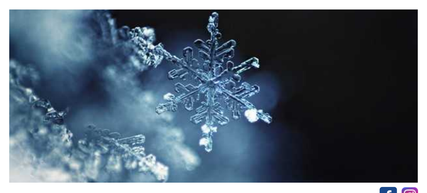
FIGURE SKATING CLUB OF SOUTHERN MARYLAND - FSCSM